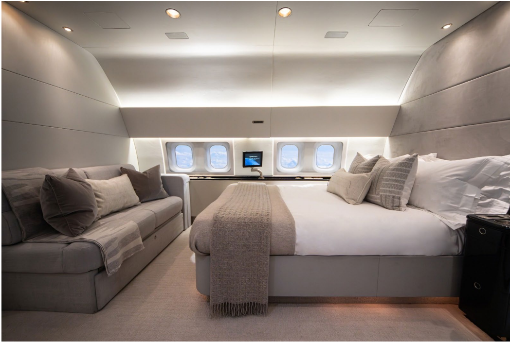
Carpet Tapis Corp Hamden CEL-HAM233 Table and Side Ledges refinished in Gloss Black RAL 9005 Cabinets finished in Classic Grey 1301 colour match S-W-00465 Matt