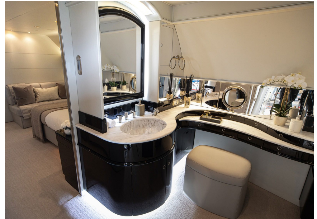
Carpet Tapis Corp Hamden CEL-HAM233 Vanity Unit finished in Gloss Black RAL 9005 Counter Tops finished is White Marble design